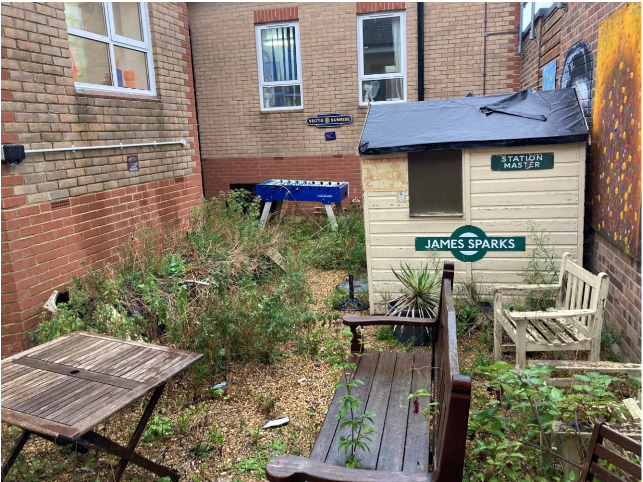
Here is a photo of the current garden